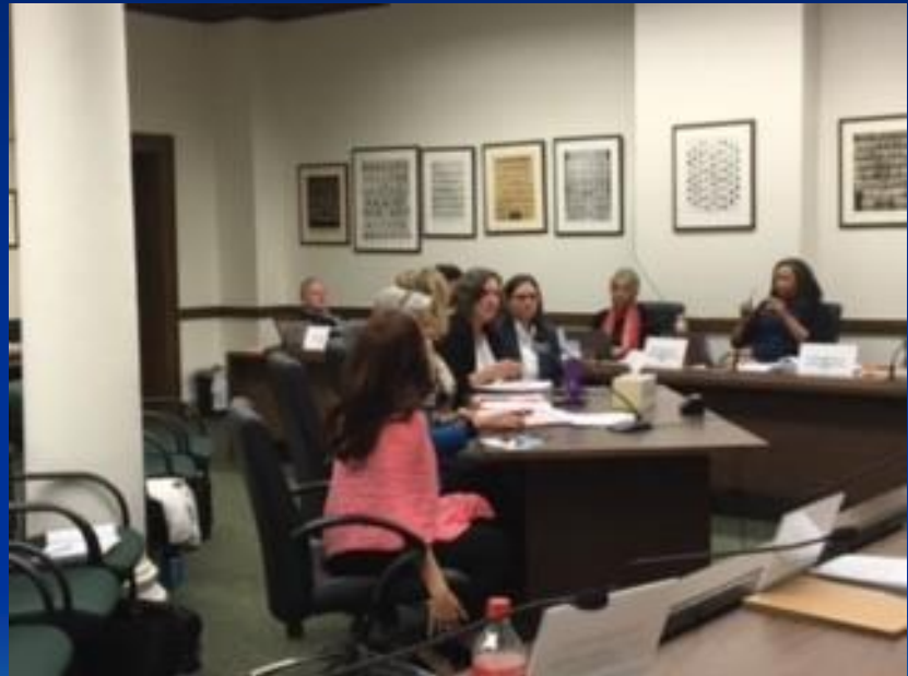
State and local ombudsmen testifying on the PACE bill in 2017.

State and local ombudsmen testify along with organizations, professional lobbyists and citizens like you!